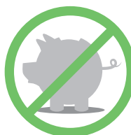
NON-DELTA DENTAL DENTISTS