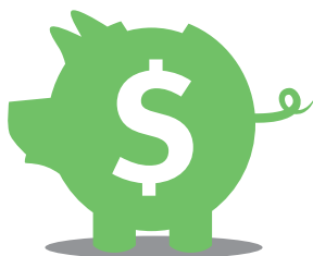
DELTA DENTAL PPO